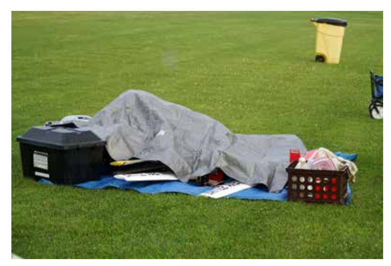
The Oosting's fleet in rain gear.