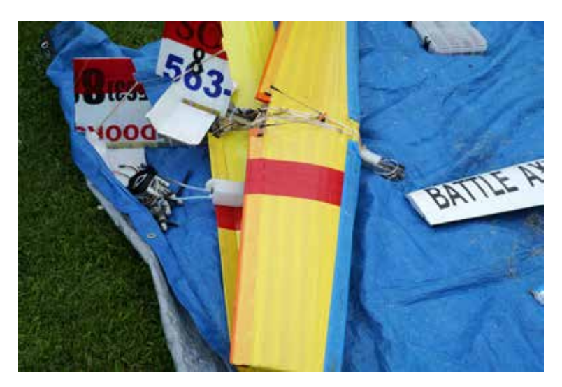
Umm ... Dirk, the motors usually go on the front of the plane.