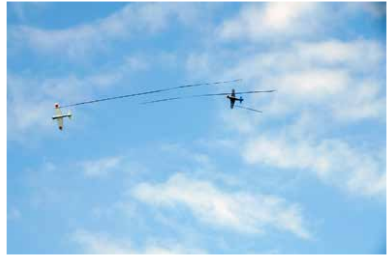
Mike LaPacz lining up for a hard to get cut in Scale 2948.