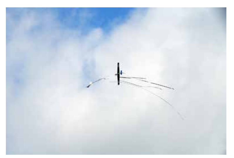
Andy Runte lining up one of many cuts today.