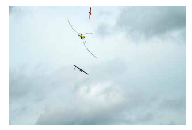
George Pritchett reaching up to grab another streamer.