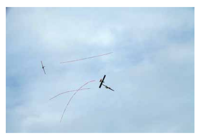
Bob Loescher reaching for that streamer just out of reach.