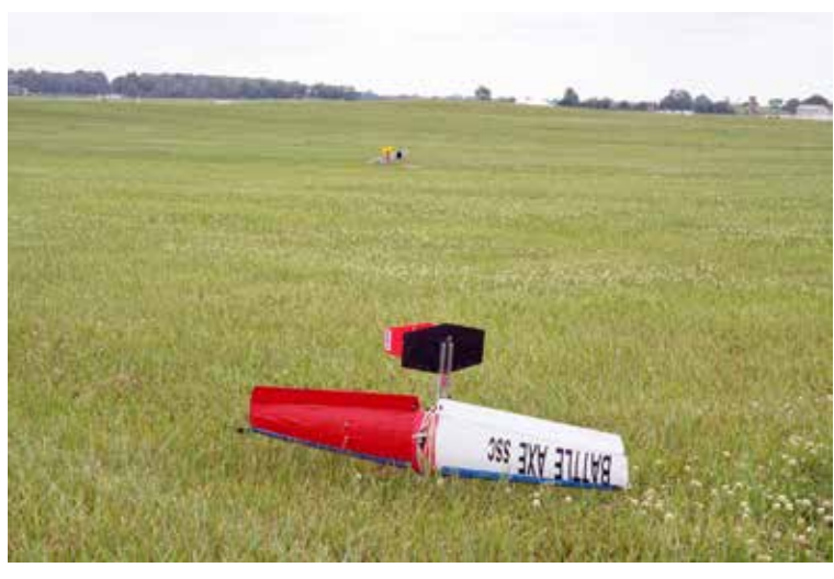
These combat planes are fully grown and ready to be picked.

Mike LaPacz's jigsaw puzzle of a van all loaded up.