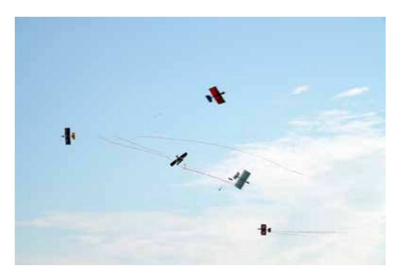
Hey George ... where's your tail going?