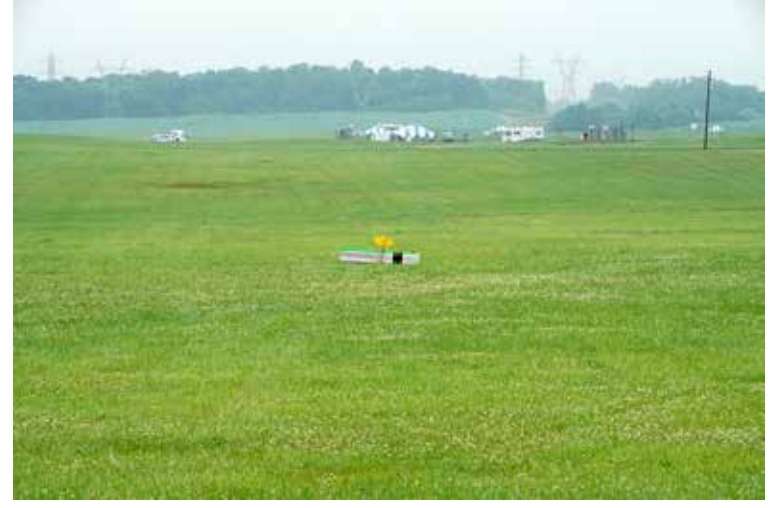
Once again there's a combat plane ready to be picked. Muncie sure does grow them fast.