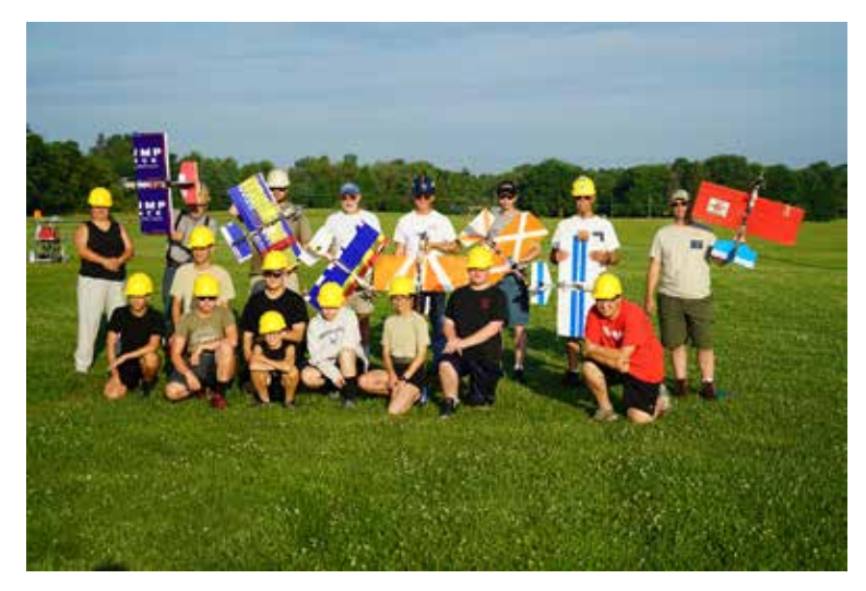
GNAT group photo.