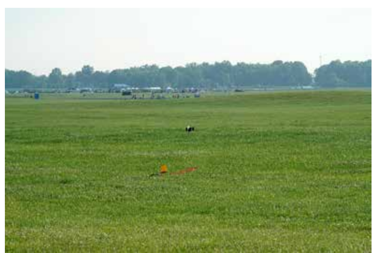
One GNAT ripe to pick and one that needs more time.