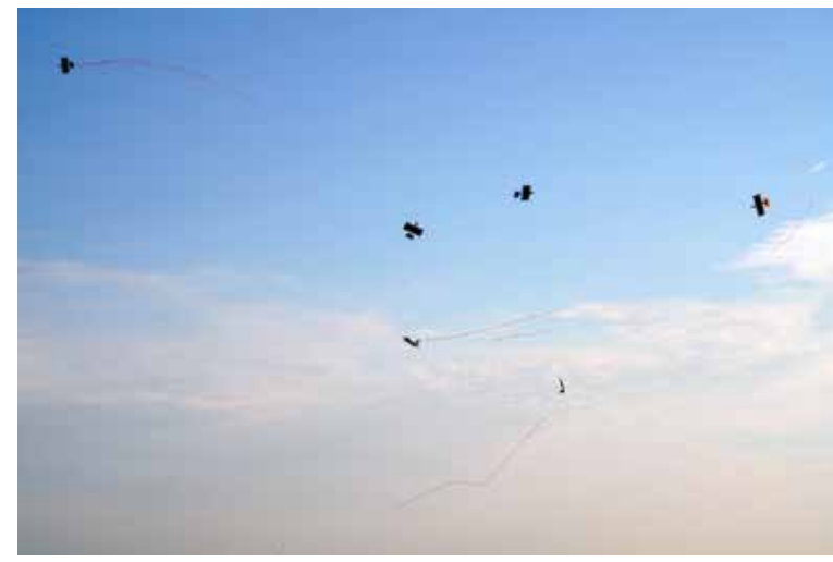
Some early morning GNAT action.