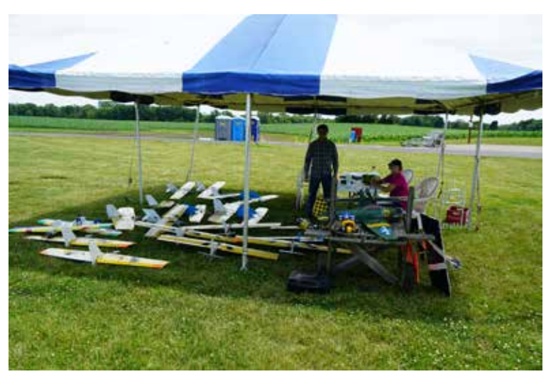
George Pritchett's fleet all ready to go.