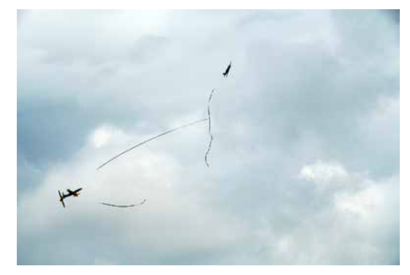
Some Scale 2948 action.