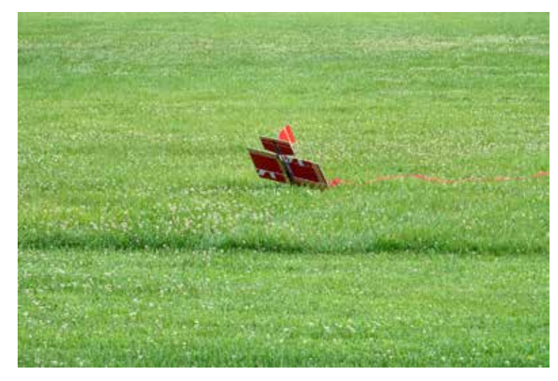
They just keep popping up all over Muncie.