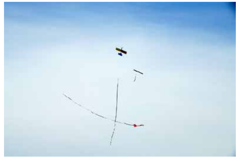
Some E-1000 action after the official events wrapped up for the day.