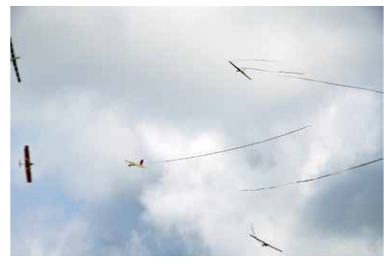
Getting the furball going.