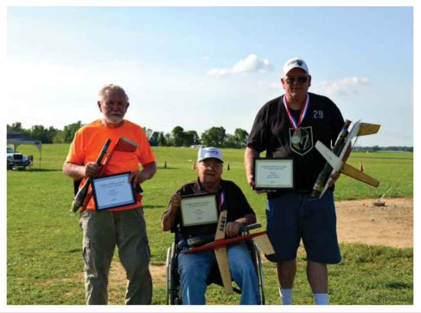
Sport Jet winners.