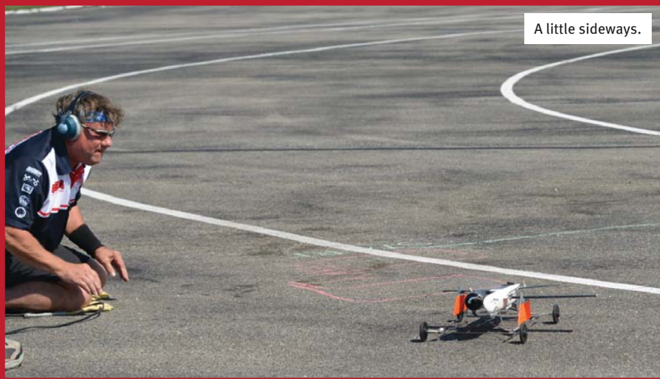
A little sideways.