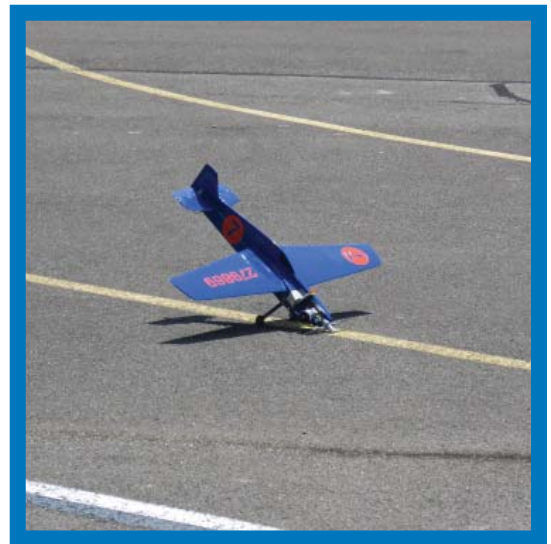
How not to land.