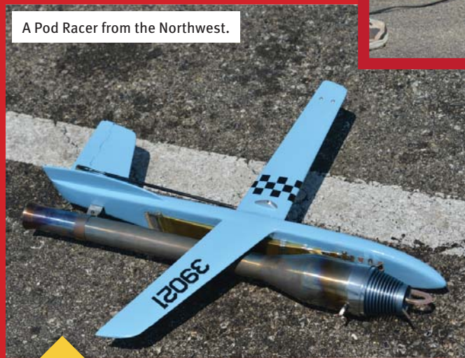
A Pod Racer from the Northwest.