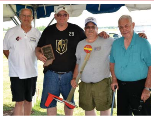
A Speed runners-up.