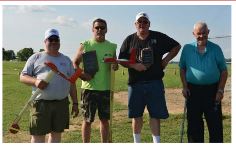
A Speed contestants.