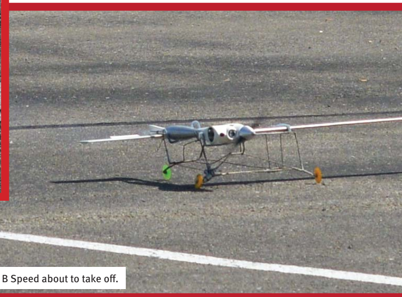
B Speed about to take off.

See more Nats event photos on AMA's Flickr page: www.flickr.com/modelaircraft