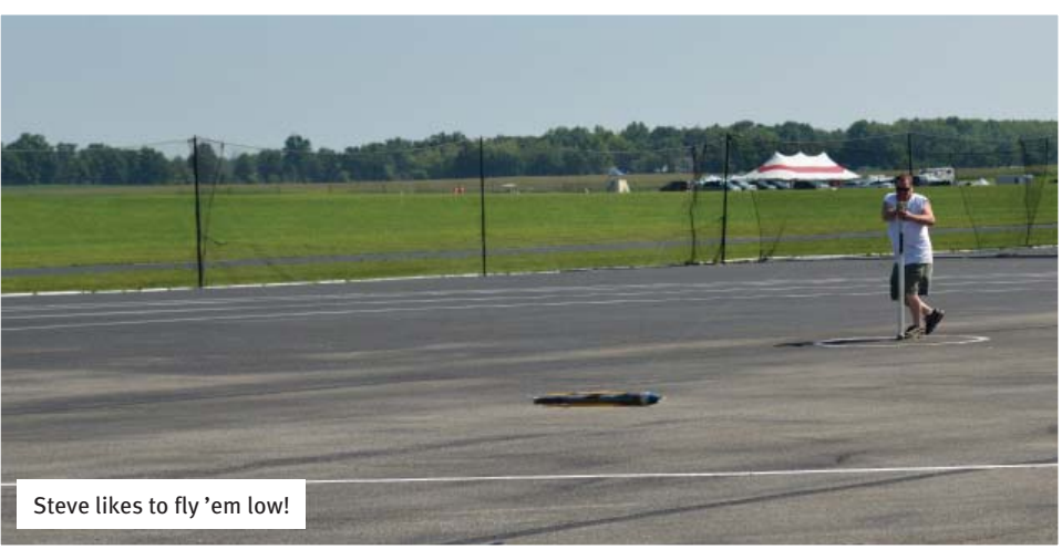
Steve likes to fly 'em low!