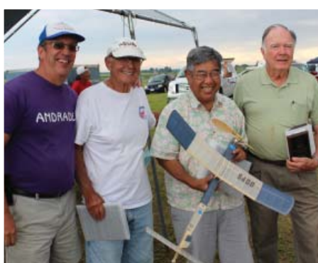
Andrade Rubber winners.