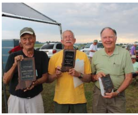
The Moffet winners.