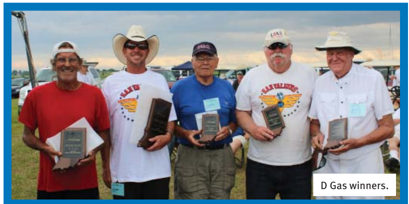
D Gas winners.