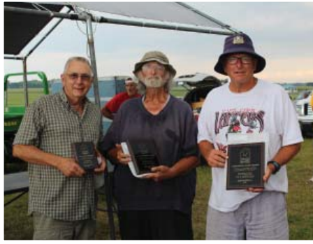
The 1/2A NOS Payload winners.