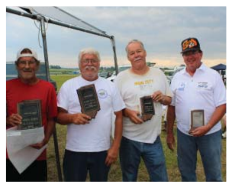
AB Classic Gas winners.