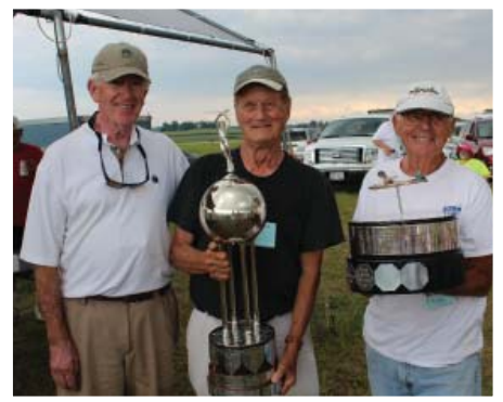
The Moffett team and trophy.