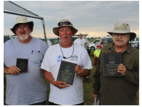
The Society of Antique Modelers (SAM) .020 Replica winners.