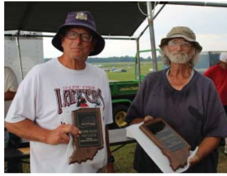
The Payload winners.