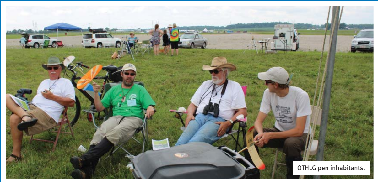
OTHLG pen inhabitants.