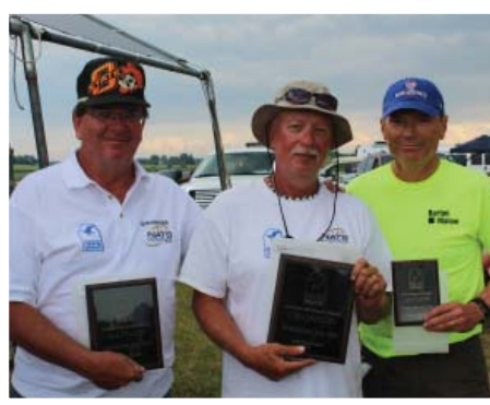
1/2A NOS winners.