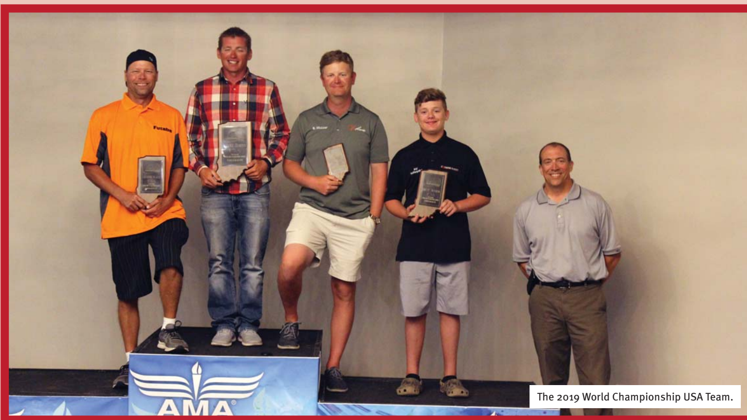
The 2019 World Championship USA Team.