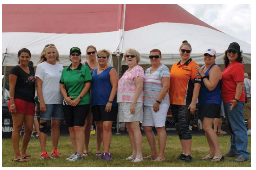
All of the women of Pylon Racing—racers, callers, and wives.