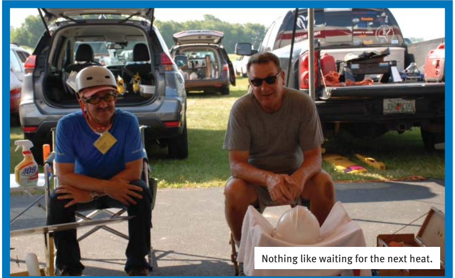
Nothing like waiting for the next heat.