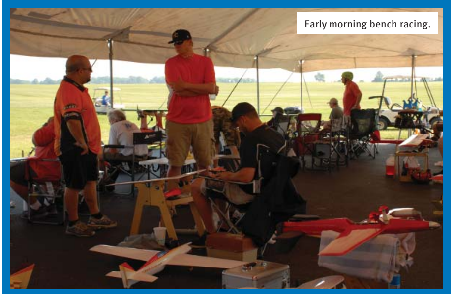
Early morning bench racing.