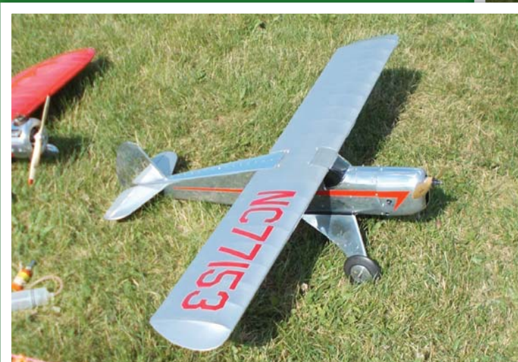
Here is a shot of Dan Banjock's 1946 Silver Streak. It is something you really need to see in person.