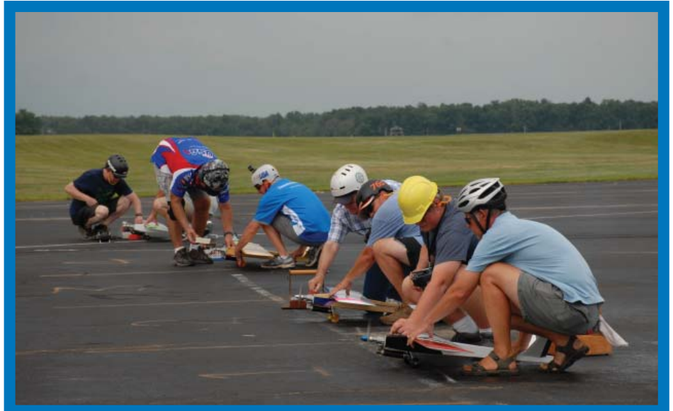
One of these things is not like the others.