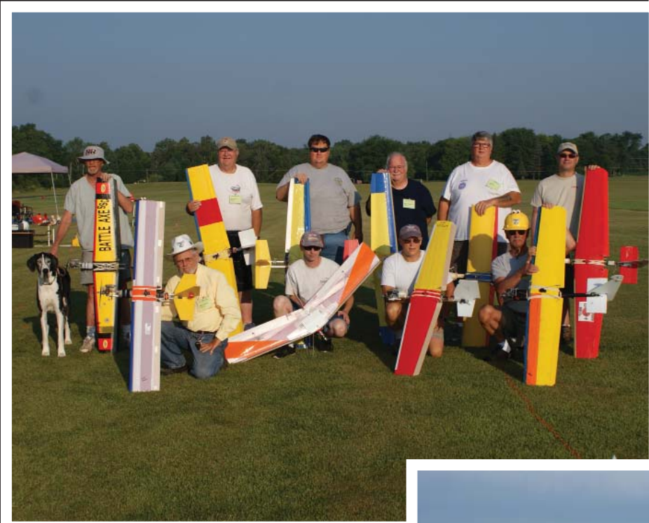
SSC Combat pilots.