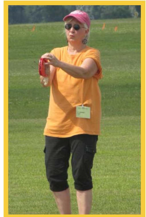
Completed high speed, "Sweet!"