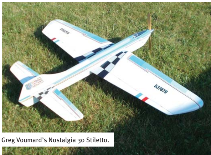
Greg Voumard's Nostalgia 30 Stiletto.