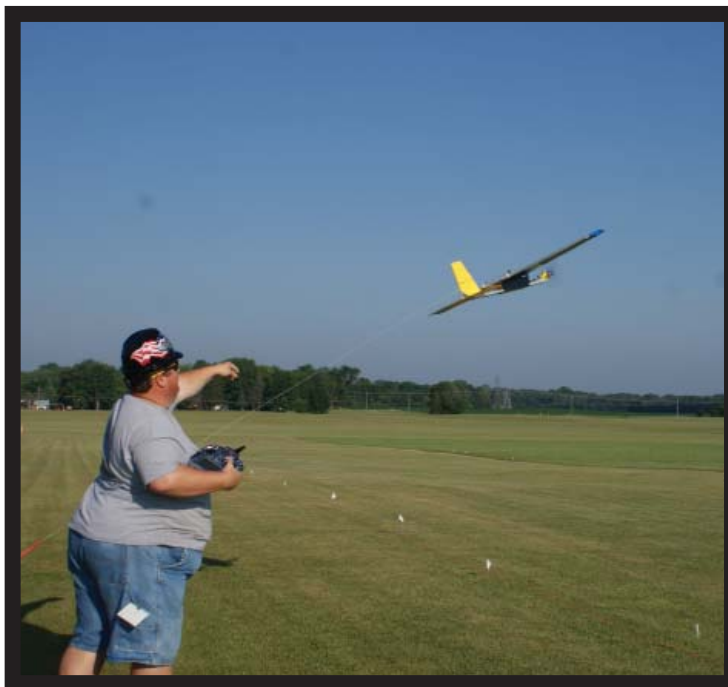
Please stay in the air this time.