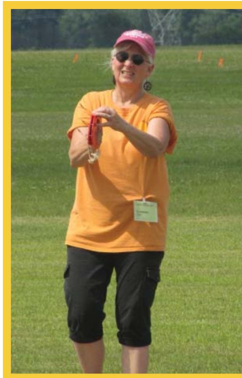
A near miss, "That was close!"