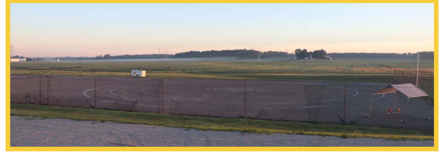
The flying site just after the sunrise before everyone arrived. The east circle is pictured here.