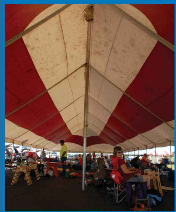
Under the big tent.