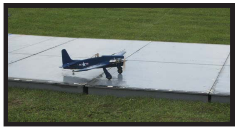
Profile Navy Carrier is flown with simpler models with profile fuselages and restricted fuel systems. This is the most popular Navy Carrier event. Shown is Bob Hawk's F8F Bearcat.