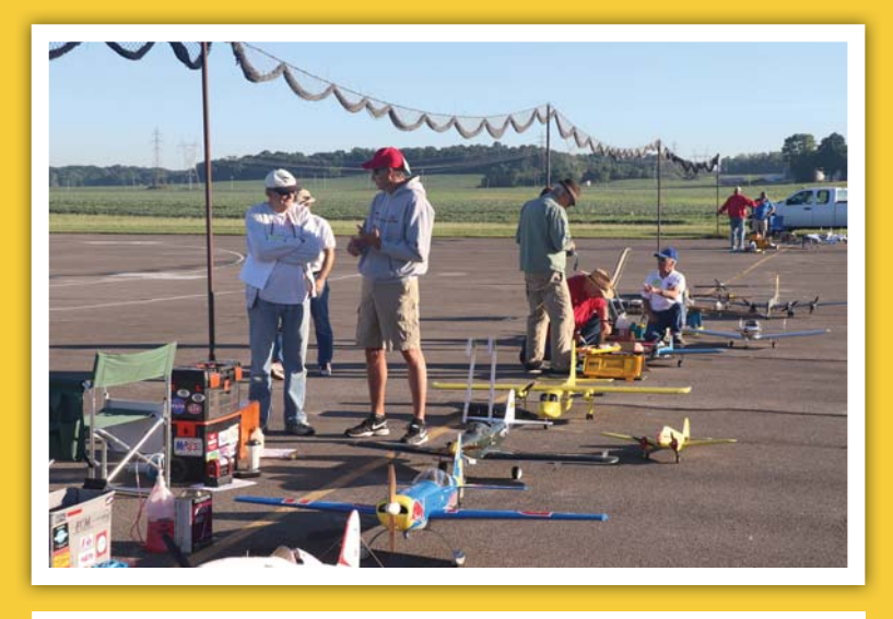
Not everyone flew again on Sunday, but the weather was fantastic with light wind, unlike Saturday afternoon.