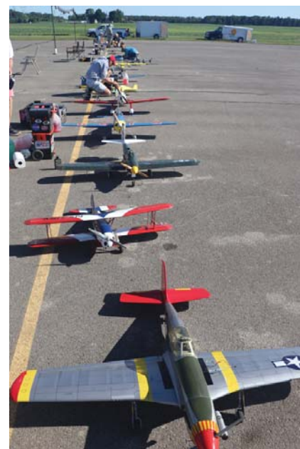
The pit area with lines stretched out as pilots get ready to fly.