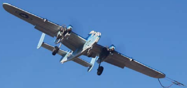
Flaps down on the B-25.