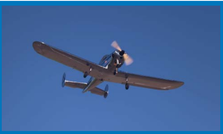
A view from outside the circle of the Ercoupe. The chrome Monokote really shines in the sun.