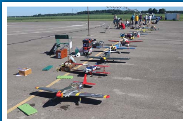
A lineup of models in the pit area getting ready for flying.