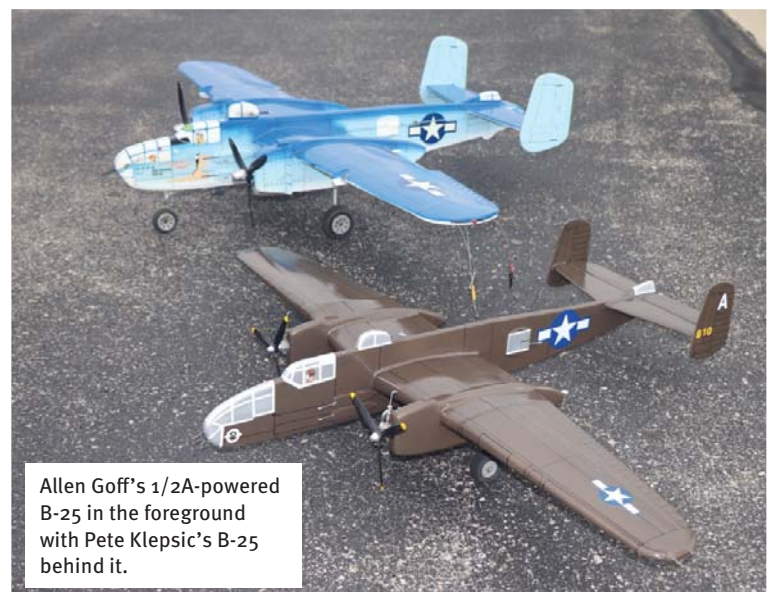
Allen Goff's 1/2A-powered B-25 in the foreground with Pete Klepsic's B-25 behind it.