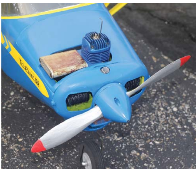
Notice the engine detail in the cowl. Details like this will increase your static score.