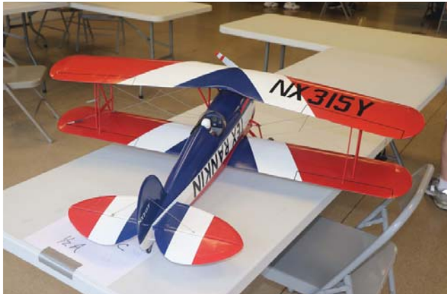
A Great Lakes Special that was flown inverted last year. Notice the "Tex Rankin" text on the fuselage is upside down.