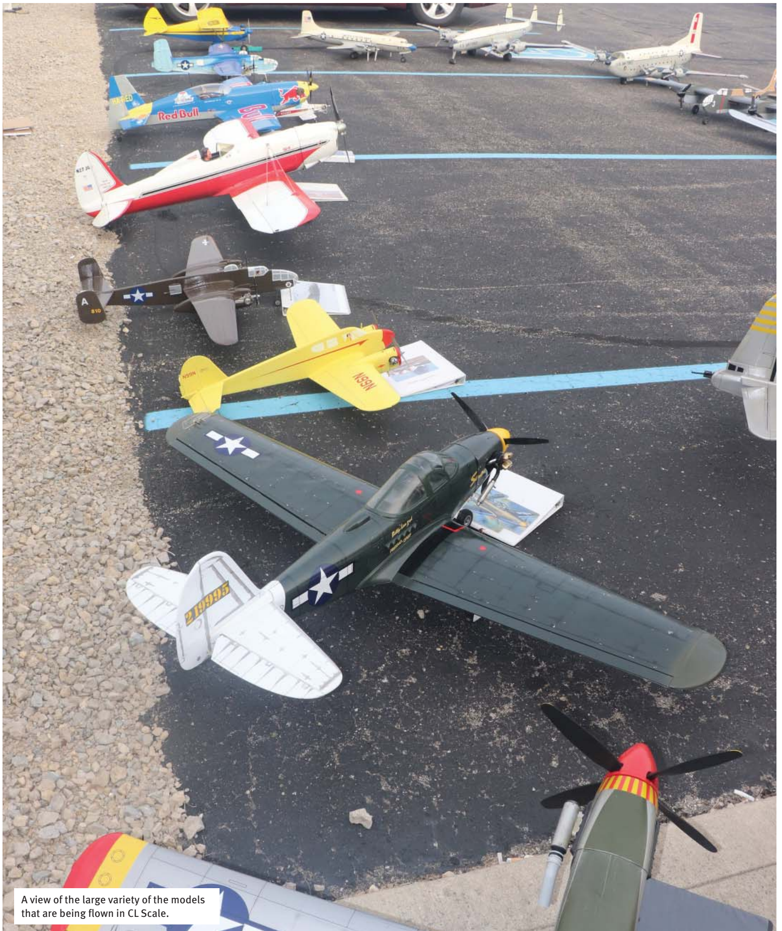
A view of the large variety of the models that are being flown in CL Scale.

Academy of Model Aeronautics 5161 E Memorial Dr | Muncie IN 47302 modelaircraft.org/nats | natsnews@modelaircraft.org