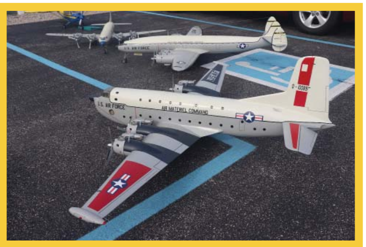
Ed Mason's C-124 Globemaster that is flown with three-line controls. This model is a challenge to fly due to its limited wing area and overall physical size.