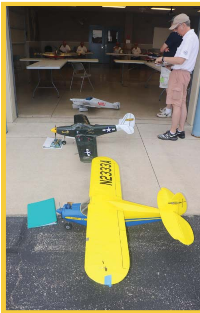
Models lined up to be judged for Fun Scale.