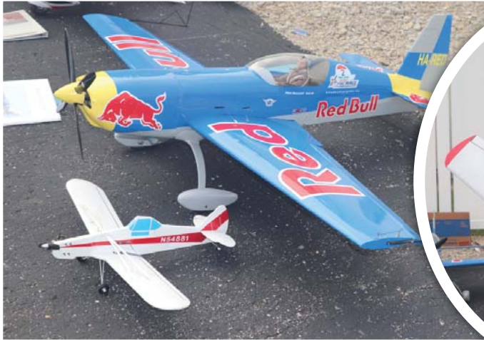
A comparison in size: Dave Betz's 1/2A scale Pawnee next to Allen Goff's Extra 300 that will be flown in Team Scale.