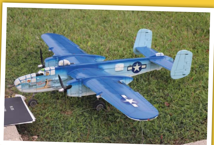
Pete Klepsic's Profile Scale B-25 is built from a Brodak Manufacturing kit. It features throttle control, flaps, and a bomb drop.