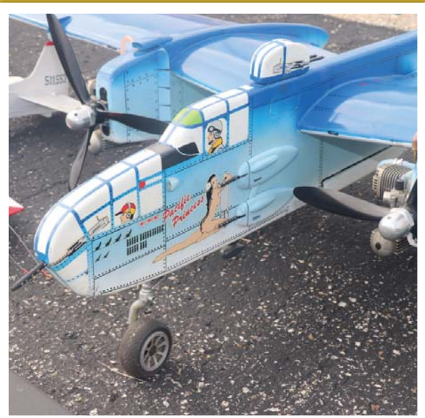
The right rivet and nose art detail will make a difference in the static score. This is Pete Klepsic's B-25.