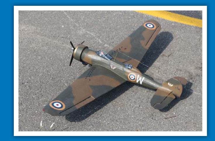
Melvin Young's 1/2A-powered Vickers Wellesley.