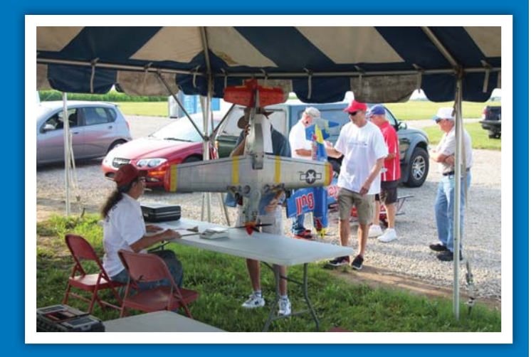
The first order of business is to check in the models before static judging to get the weight and other information.