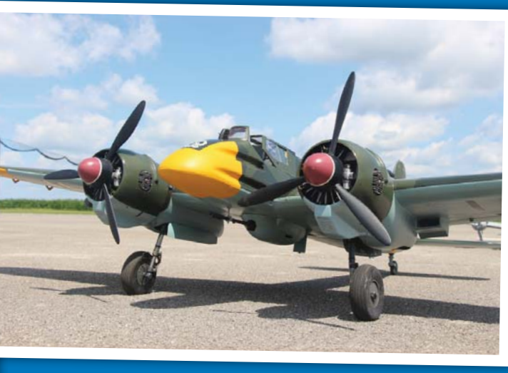
The detail on Chuck Synder's Henschel Hs 129 can be seen from this angle.