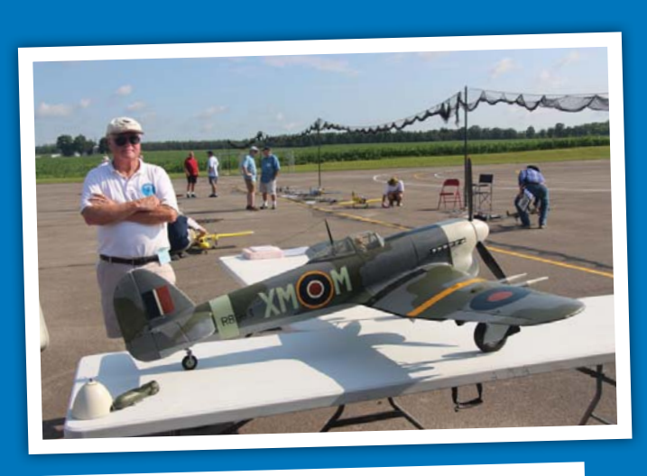
Chuck Snyder's Hawker Typhoon 1B being judged for Sport Scale.