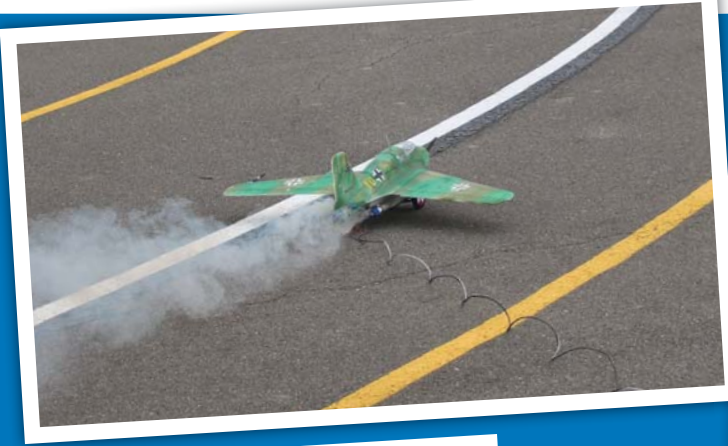
Jim Smith's Me 163 Comet was flown in Fun Scale.

All pictures were taken at the 2017 CL Scale Nats unless noted otherwise.