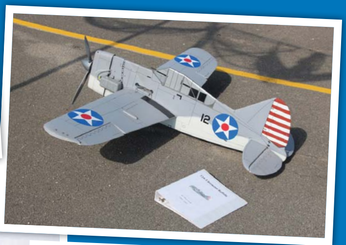
Allen Goff's Brewster F2A Buffalo that was flown in Profile Scale. The documentation package is next to the model.