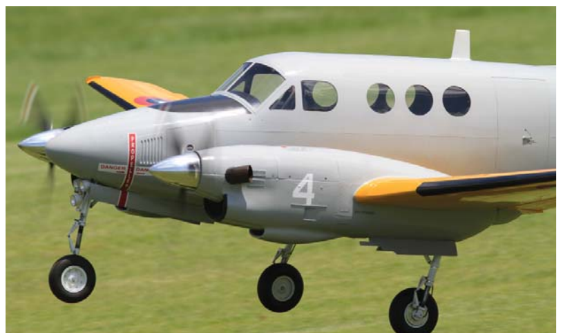
The big Beechcraft King Air blasts off in another takeoff on its way to winning Team Scale.