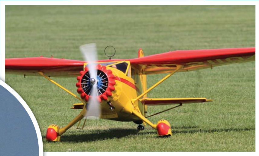
Jeff Pike's Stinson SR-10 built from a Top Flite kit finished second in Team Scale with Steve Eagle flying and controlling the sticks.