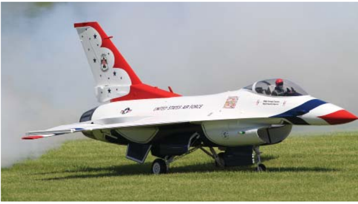
Frank Noll's BVM F-16 puts on a show with smoke on! The big fighter in Thunderbird colors carries a half gallon of smoke fluid. It finished a close second in Fun Scale Open.