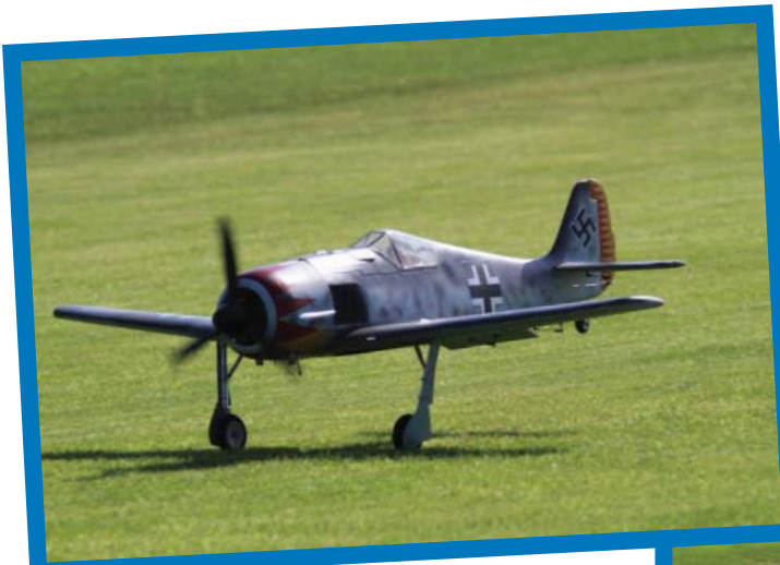
Keith Numbers' Fw 190 comes in for another landing. It finished in sixth place in Fun Scale Open.