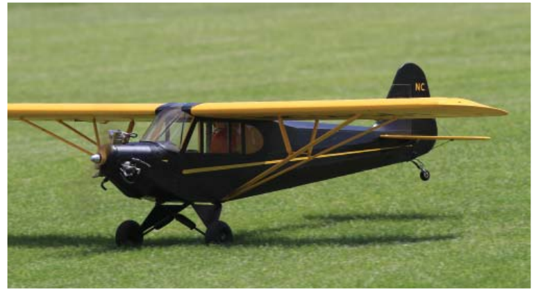
The Piper J-3 Cub-P by Tim Dickey from Chandler AZ, makes a flyby. There were only 11 built with the three-cylinder engine before the Continental flat four came out. The scale aircraft finished fifth in Open Scale.