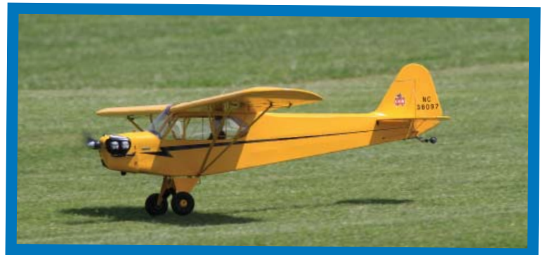
Jeff Pike's 1/4-scale Piper J-3 Cub built from a Sig kit finished first in the Open class. It utilized an O.S. 1.60 twin for power and was painted with Emron paint.

NASA always tries to recognize the sponsors in as many ways possible. Sponsor boards lined the road to the Nats this year.