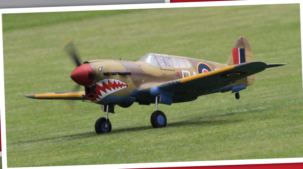
This Zirol P-40 entered by Mike Fearing was powered by a DLE-85 gas engine and finished in a variation of the Flying Tiger's color scheme British markings for North Africa.