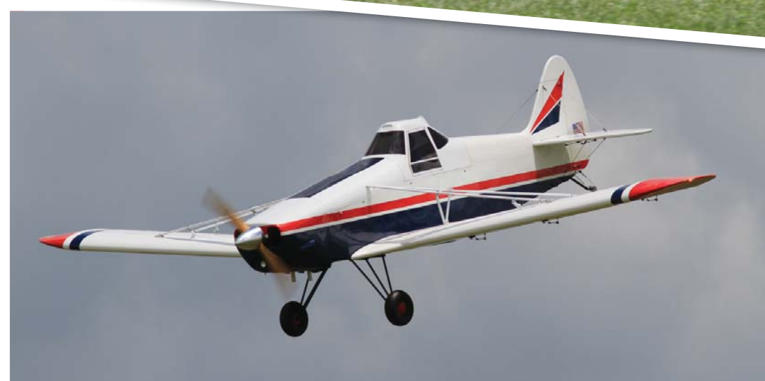
The largest model in the competition is this PA-25 Pawnee with a wingspan of 16 feet, entered by Adam Grubb. Power is provided by a 3W-210 twin engine and it's controlled by a Spektrum radio system.