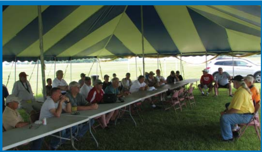
A NASA membership meeting was held Saturday in the static tent.