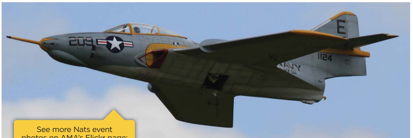
See more Nats event photos on AMA's Flickr page: www.flickr.com/modelaircraft