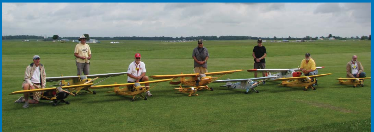
The group of J-3 Cubs and different types of Cubs entered in the competition, with their owners.