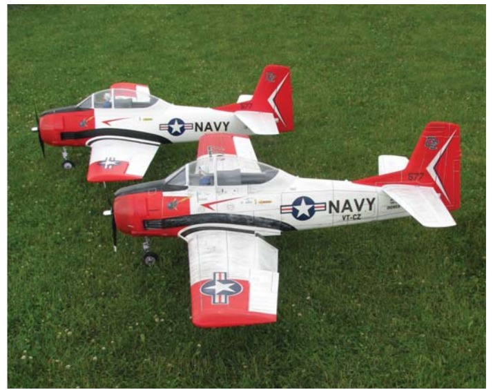
Two Hangar 9 Carbon Z T-28s entered in Fun Scale. There is no builder of the model rule in this class—you just need a photo of the subject aircraft.