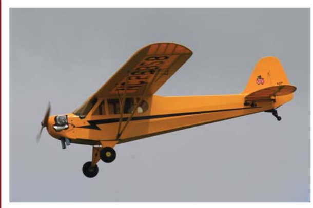
This 1/3-scale J-3 Cub was entered by Jim Martin. It was built from a Balsa USA kit and powered by a DLE twin engine.