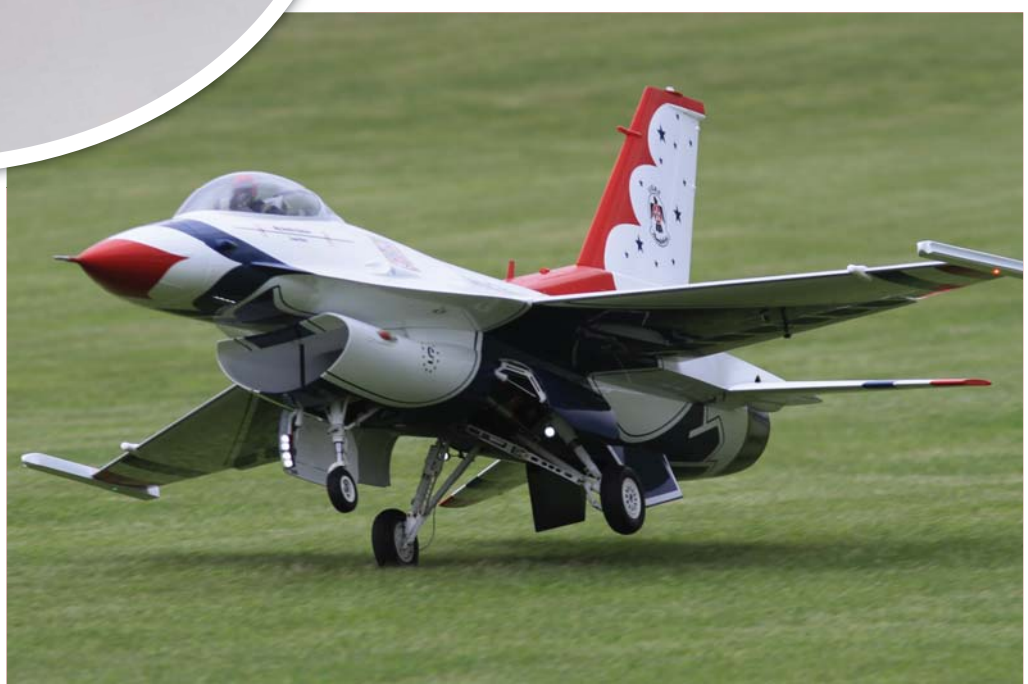
Right: Another shot of Frank Noll's F-16 just as it lands. It's an impressive jet for the Fun Scale Open class.