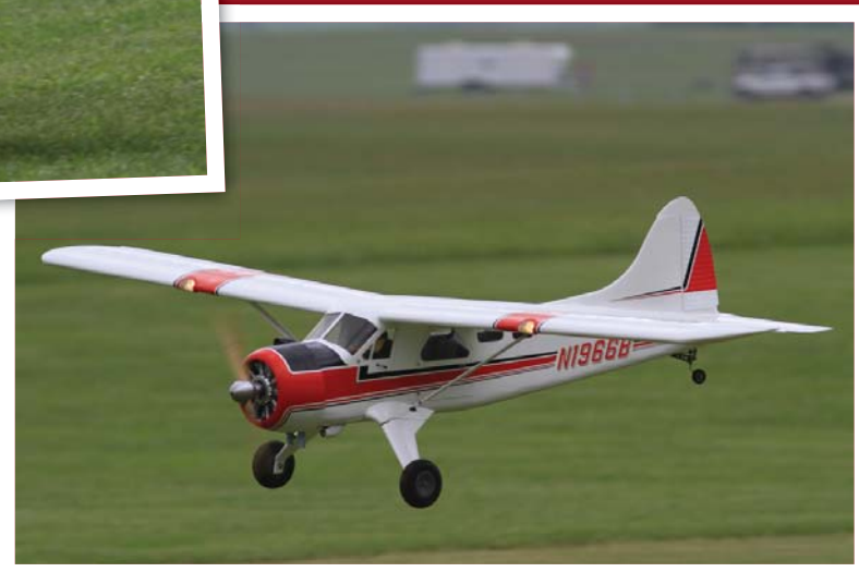
Earl Dever Sr. flew this DHC-2 Beaver in Fun Scale. The model is from a Hangar 9 ARF. The landing lights are on!