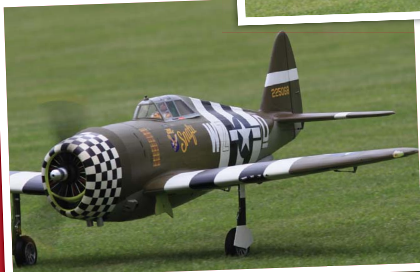
Earl Dever Jr.'s model of a Snafu, a scale version of the full-scale restored P-47 which is in England, is shown here on a takeoff run. It was built from a Top Flite kit and is powered by a DA-50.