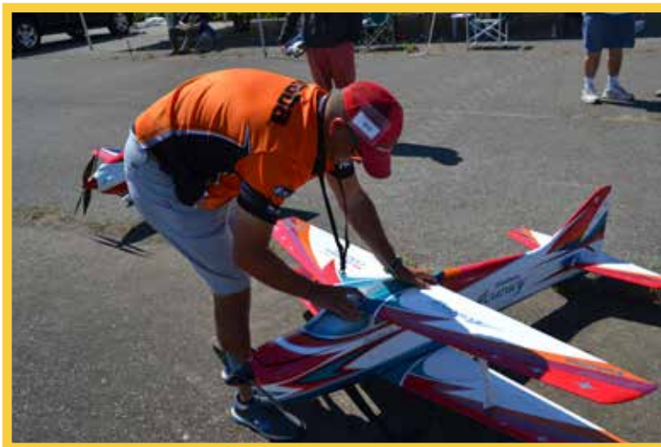
Getting ready to fly and securing the canopy.