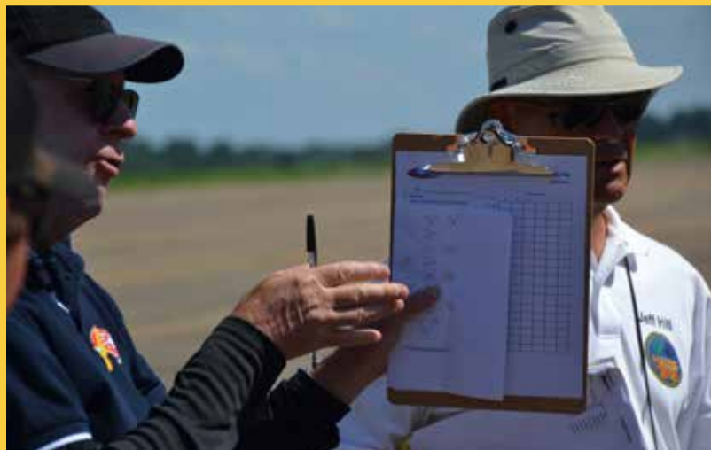
Pilots discussing the Unknown 2 FAI pattern they received at the end of the banquet Friday night.