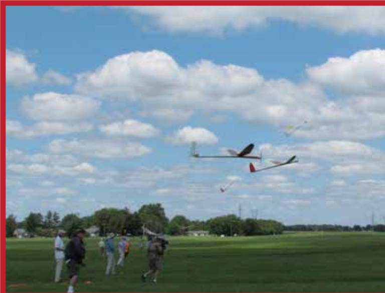
A late round launch. (Note the increase in clouds from the morning round!)