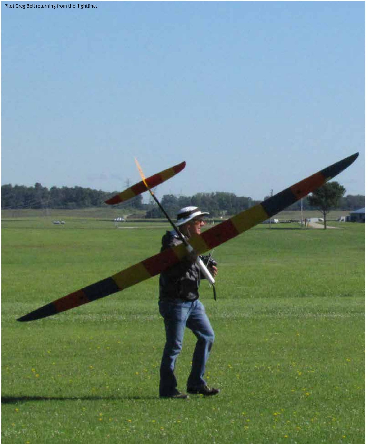
Pilot Greg Bell returning from the flightline.