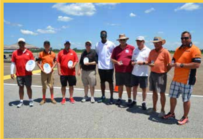
The Masters winners.