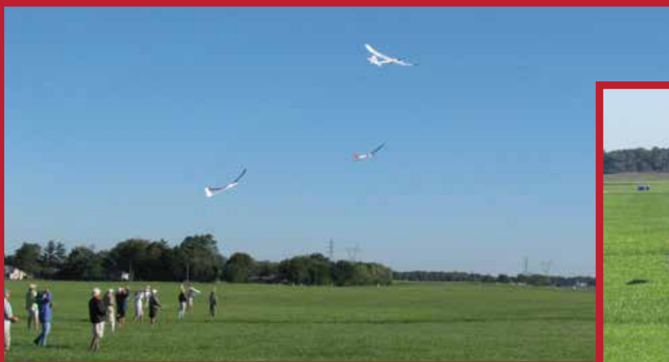
Early morning launch, with not a cloud in the sky.