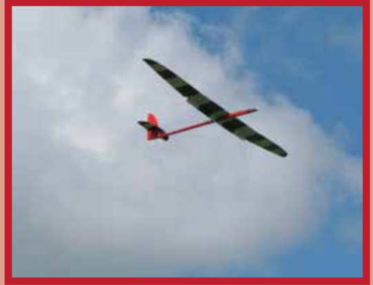
Flaps down for final approach.