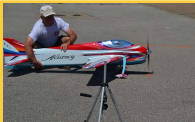
An assistant holding an airplane during run-up to check its noise level. A microphone is hanging below the tripod.