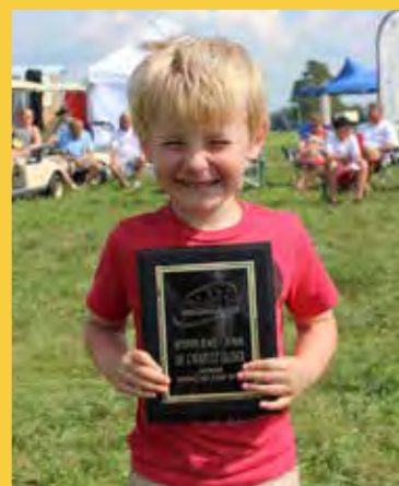
Free Flight is fun!