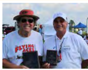
FAC Jet Cat winners.