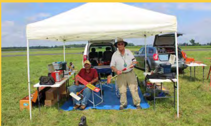
The Colorado contingent.