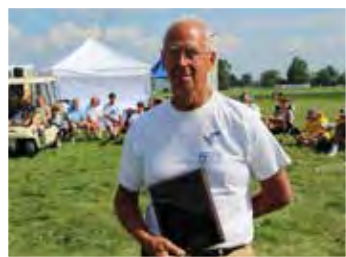
ABC NOS Electric winner.