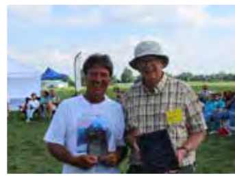
Classic Towline winners.