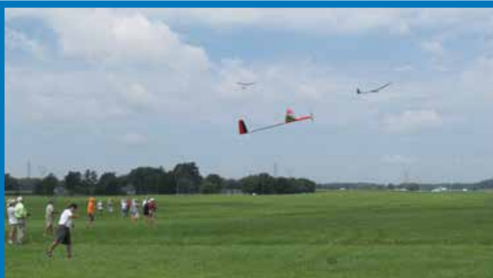
Moments after launch.