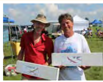
Hi-Start Glider winners.