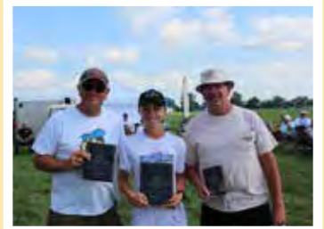
1/4A NOS winners.