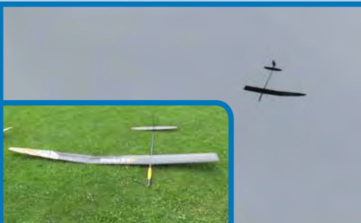
The result of a midair collision.