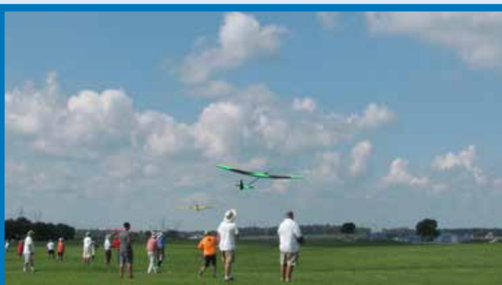
Launching into great, but windy, lift.