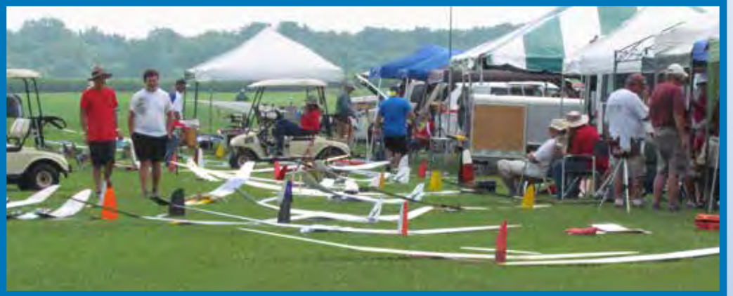
Looking over the big boy toys in the pit area.