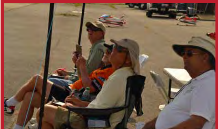
Judges watching a flight using the new electronic scribe system.