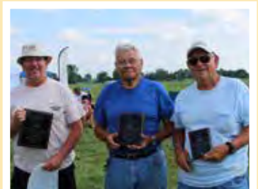
Early 1/2A NOS Gas winners.