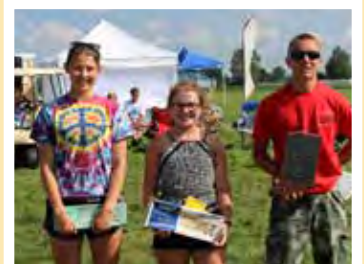
Senior P-30 winners.