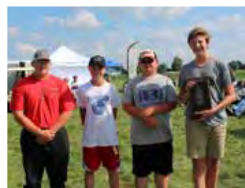
Junior P-30 winners.