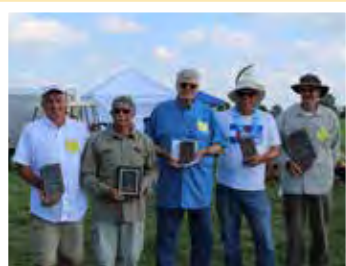
Open P-30 winners.