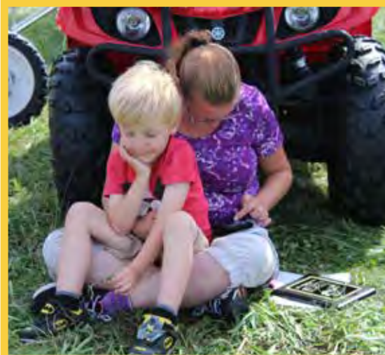
It's been a long week Mom, but it was fun!