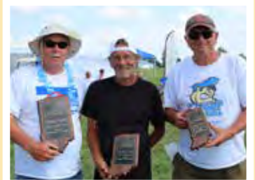
The CD Classic Gas winners.