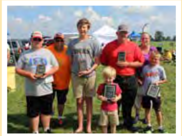
Junior Catapult winners.