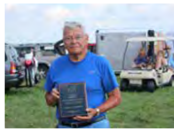
Super D winner.