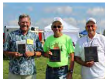
Pee Wee 30 winners.