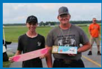
Junior F1P winners.