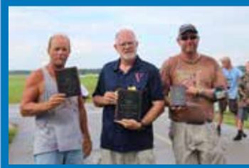
FAC WW II Mass Launch winners.