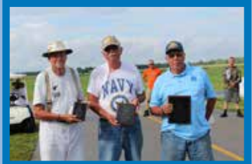
SAM OT Pylon winners.