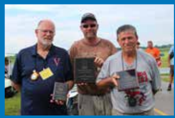
OT Rubber Fuselage winners.