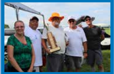
The "BBK" team HLG winners.