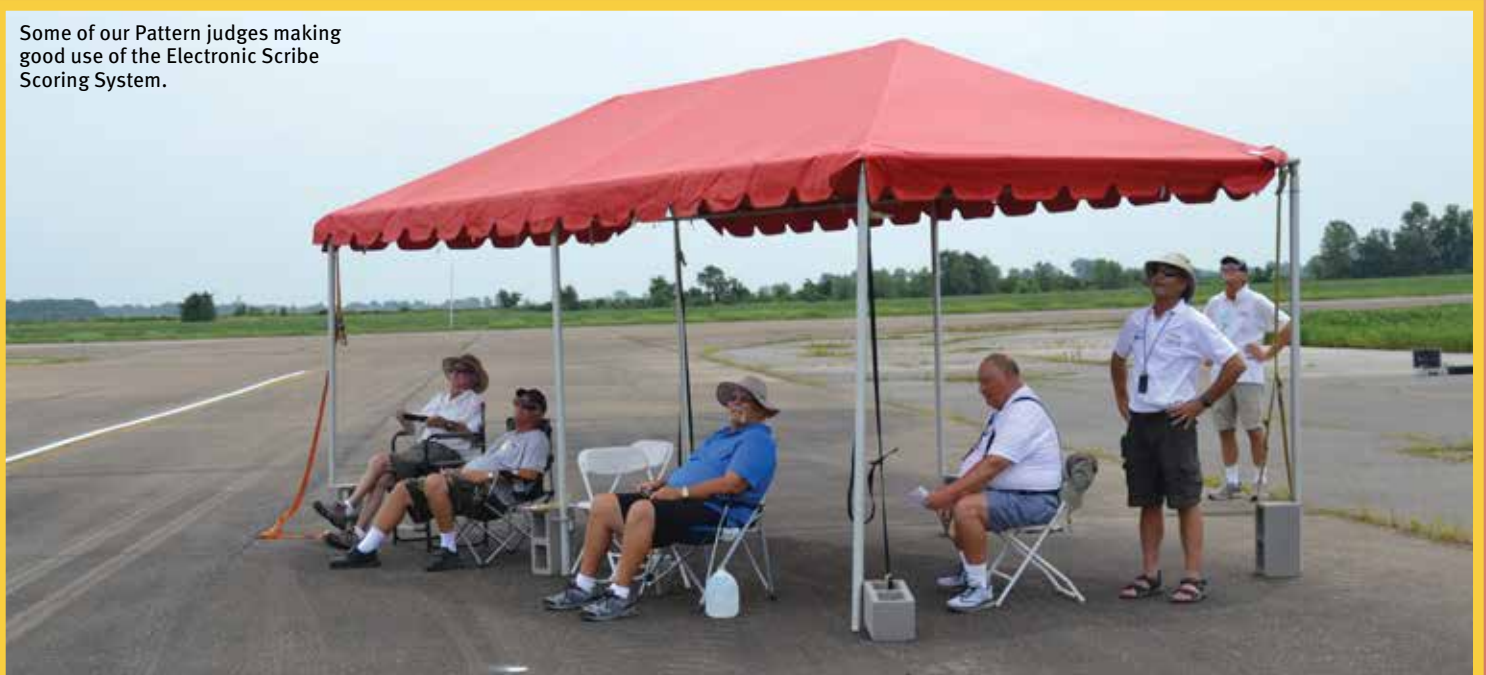
Some of our Pattern judges making good use of the Electronic Scribe Scoring System.