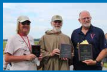
FAC Embryo winners.