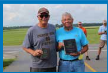
C NOS Gas winners.