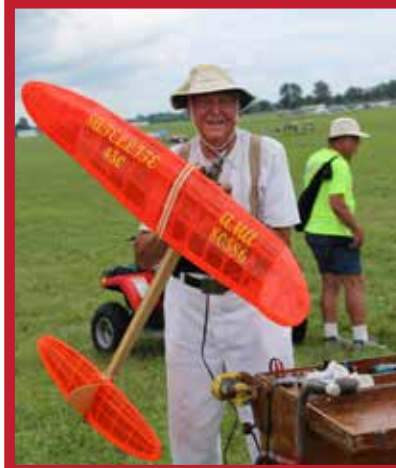
New 2017 Hall of Famer Hank Sperzel.