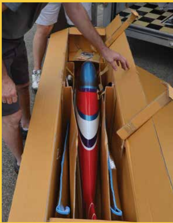
Brian Herbert and Brett Wickizer's new Pattern model, top view, still secure in it's box.