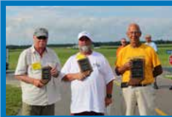
A Electric winners.