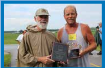
FAC Golden Age winners.