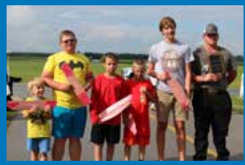
Junior HLG winners.