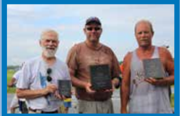
FAC Greve/Thompson Mass Launch winners.