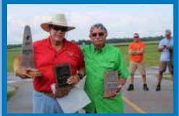
Open F1G winners.