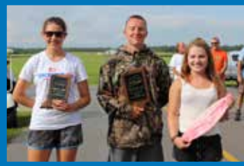
Senior HLG winners.