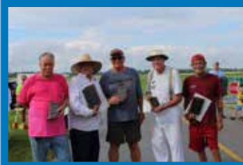
A Gas winners.