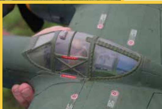
Cockpit details on Duke Horn's P-38.