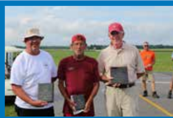
NOS Rubber winners.