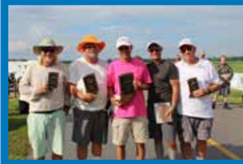
Open HLG winners.