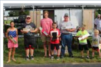
Junior Catapult Glider winners.