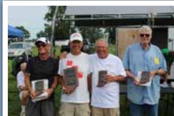
Open Catapult Glider winners.