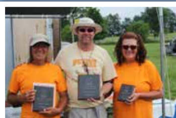
One-Design Rubber winners.