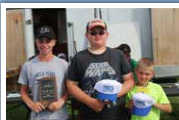
Junior E-36 winners.