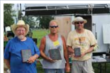
FAC OT Rubber Stick winners.