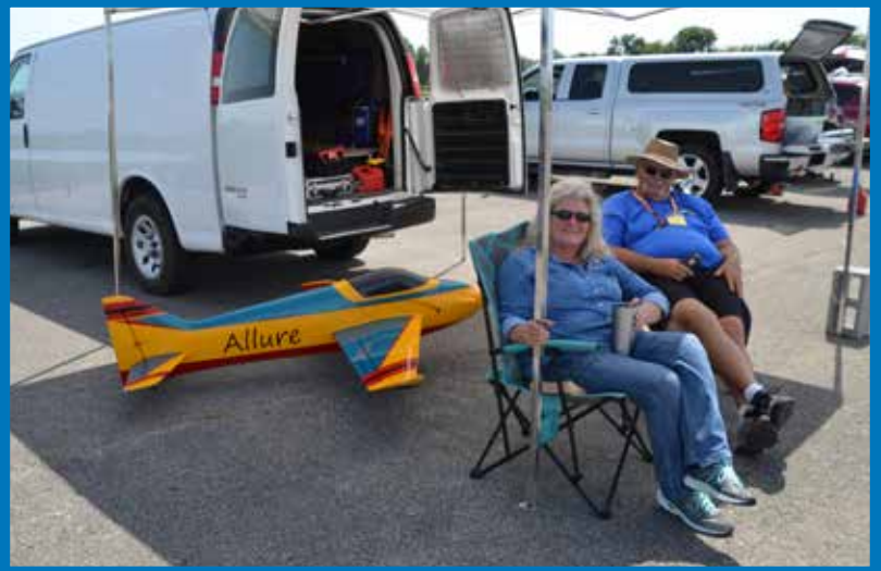
One of our Precision pilots with his wife who also serves as his caller.