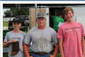
Senior E-36 winners.