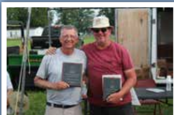
NOS B-Gas winners.