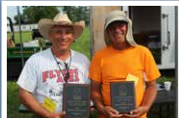
FAC Hi-Start Glider winners.