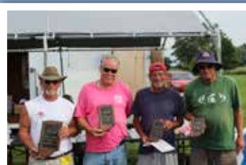
1/2A Classic Gas winners.