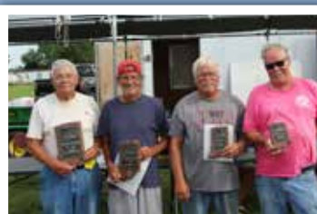
B Gas winners.