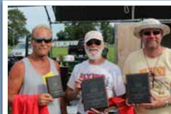
FAC Low Wing Trainer winners.