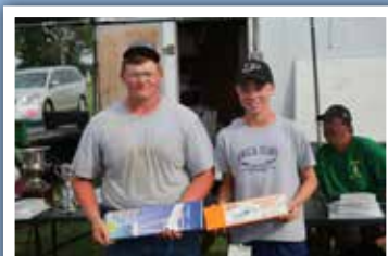
Junior F1J winners.