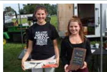
Senior Catapult Glider winners.