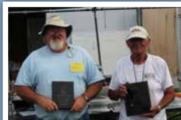
SAM OT/ABC Rubber winners.