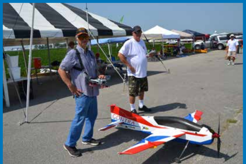
This aircraft uses interesting, new technology. The contra-rotating dual propellers work in opposite directions, which eliminates the usual torque of a single propeller.