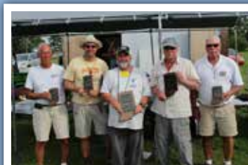
Open E-36 winners.