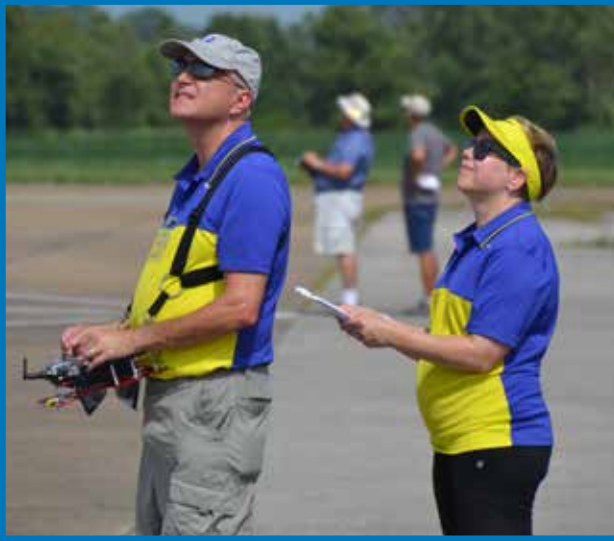
A stylish husband and wife pilot and caller.