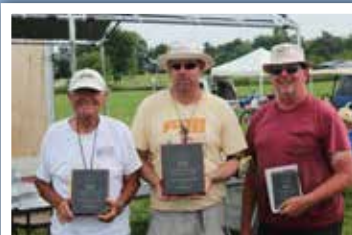
NOS Rubber winners.