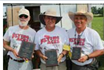
FAC Dime Scale winners.