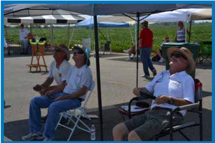
The judges on one of the flightlines use the new "Scribe" system for scoring.