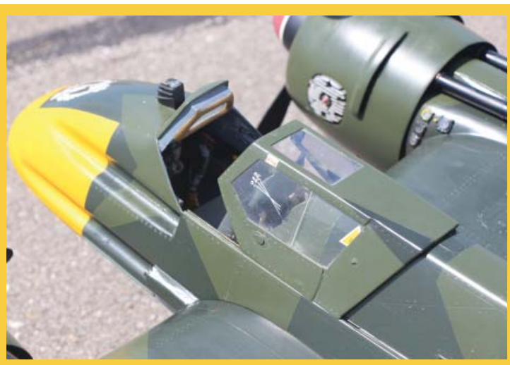
Left: Cockpit detail in Chuck Snyder's Henschel HS 129 Authentic Scale model.

The Zero being flown by Jeff and James Jensen in Team Scale started out as a fiberglass fuselage, with parts being scratch-built to finish out the airplane. 🛩️