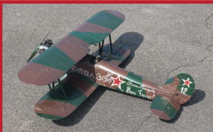
Leo Derbarmdiker's Polikarpov Po-2 biplane for Authentic Scale.