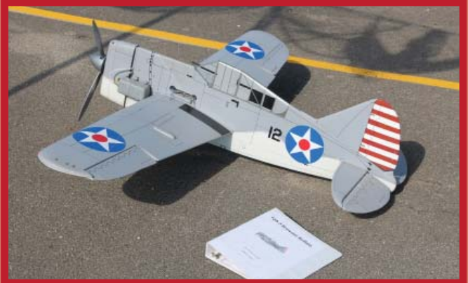
Allen Goff's Brewster F2A Buffalo for Profile Scale.