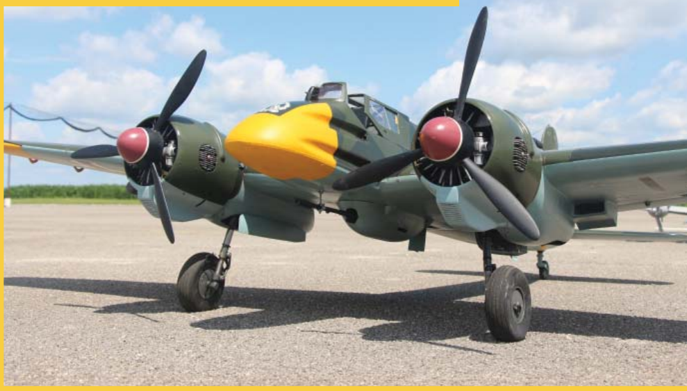
Below: A front view of Chuck Snyder's Henschel HS 129 aircraft that will be flown in Authentic Scale.