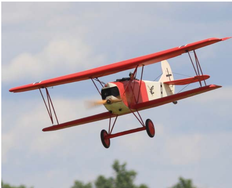
The Fokker D.VII by Ken Alcorn built from a Balsa USA kit.