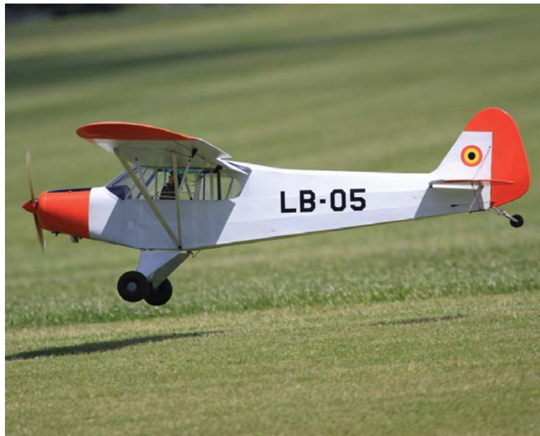
Ted Roman's 1/3-scale Super Cub makes a takeoff run on the grass runway.