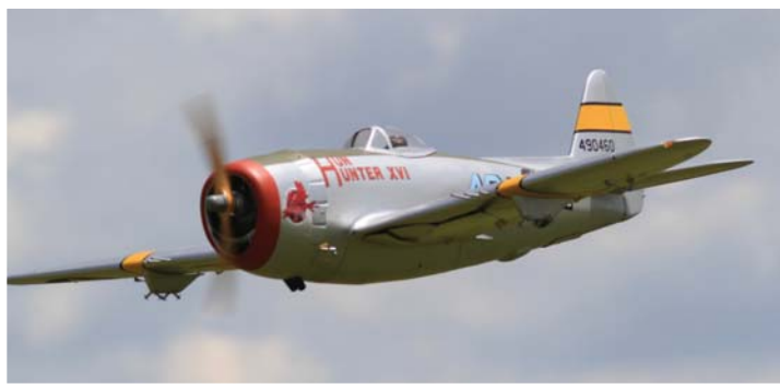
Mike Wartman's P-47 built from a Top Flite kit features a sliding canopy, navigation lights, and more than 30,000 applied rivets.