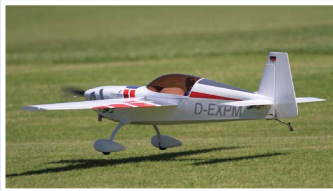
Evan Gaston's Extra 300 touching down after another successful flight.