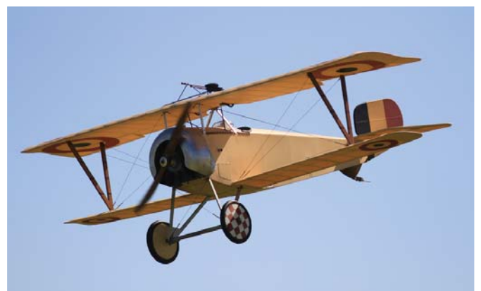
The Nieuport 11 by Art Shelton flown in Expert class.