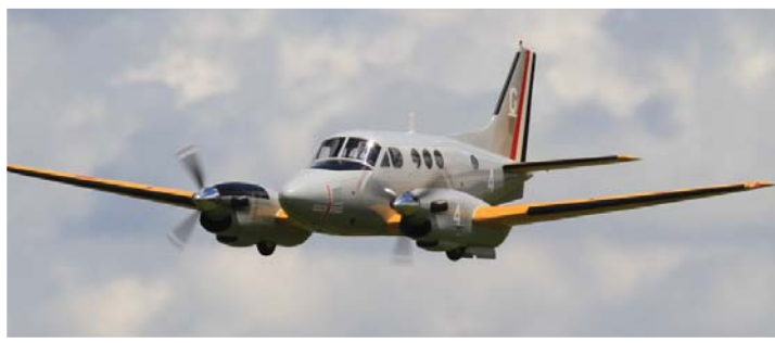
Mike Barbee's 155-inch Beechcraft King Air shown in flight is controlled by a Futaba radio and features electric-powered air retracts.