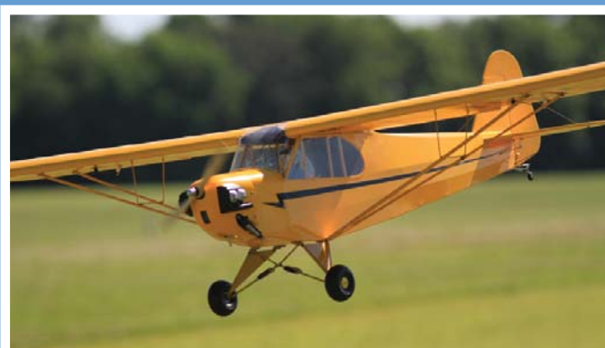
Dale Arvin's Balsa USA J-3 Cub powered by a O.S. 1.2 four-stroke engine.