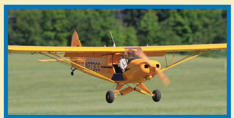
Larry Folk's 1/3-scale Top Cub makes a low pass in front of the judges.